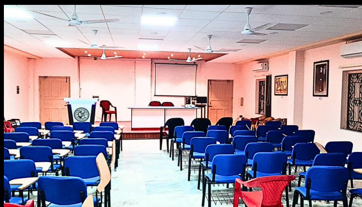
ICT Enabled Seminar Hall