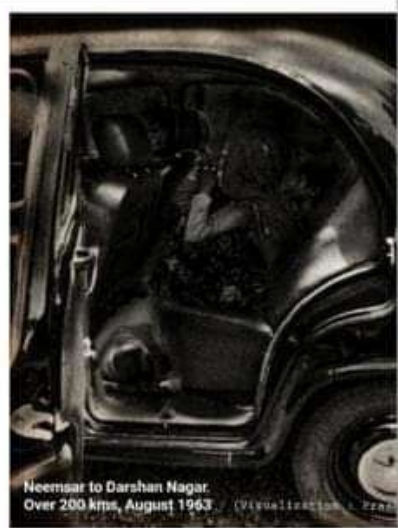
Neemzar to Darshan Nagar. Over 200 kms, August 1963. (Visualization)